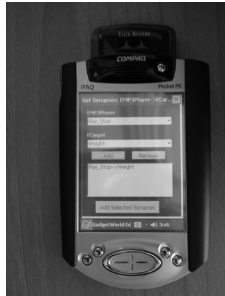
Figure 3. The GadgetWorld Editor running on an iPAQ.

A central research question for the eGadgets project is whether the end-user will be inclined and able to use GAS