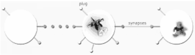
Figure 1: A visualisation of the basic vocabulary terms: eGadget, Plug, Synapse, GadgetWorld

supports the encapsulation of the internal structure of an eGadget (eGadgets are treated as “black boxes”, based on their public interface as manifested by the Plugs), and provides the means for composition of an application, without having to access any code that implements the interface [2]. Thus, this approach provides a clear separation between computational and compositional aspects of an application [4], leaving the second task to end-users. The benefit of this approach is that, to a large extent, system design is provided ready to the end user, because the domain and system concepts are specified in the generic architecture.